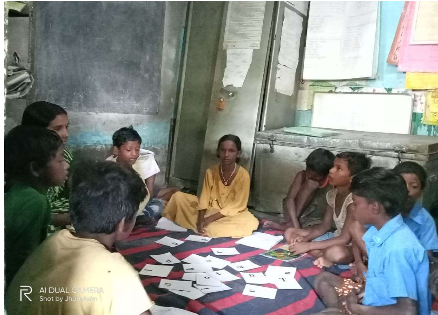
Learning alphabets through letter cards