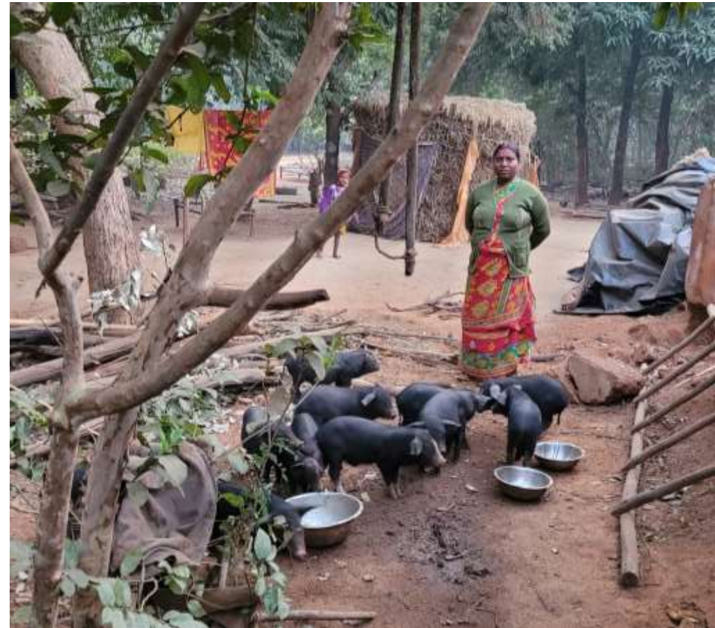
Home visit to see the new-piglets of the piggery initiative (before the deadly disease occurred)