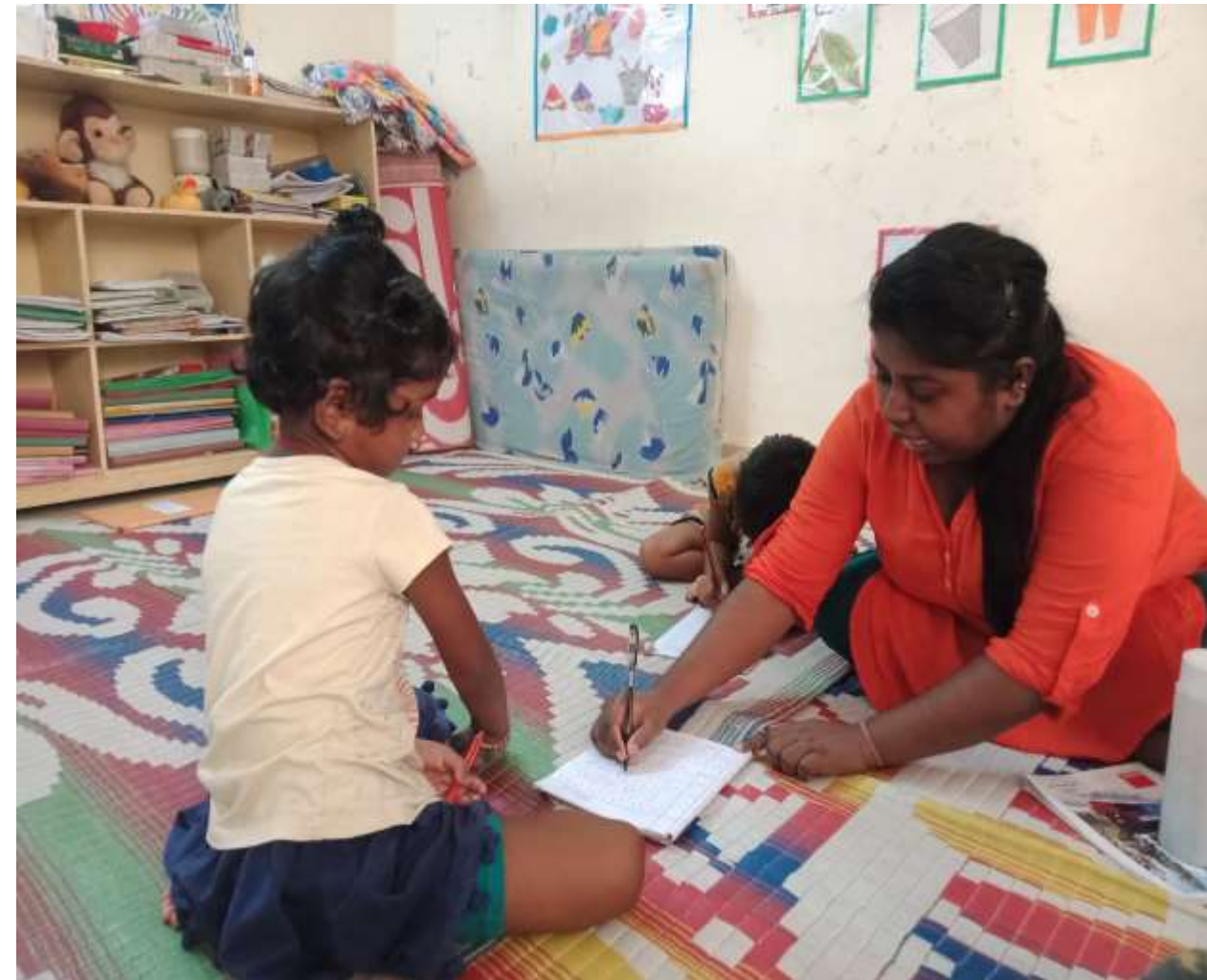
Creche mother of Tulip working on School readiness