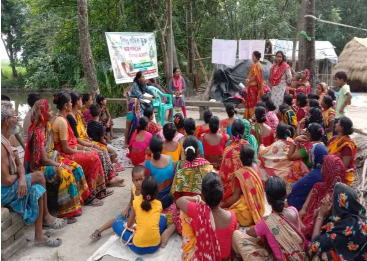
Meeting with Child Right Protection Forum(CRPF) members of Duttapara village, Gobindapur GP