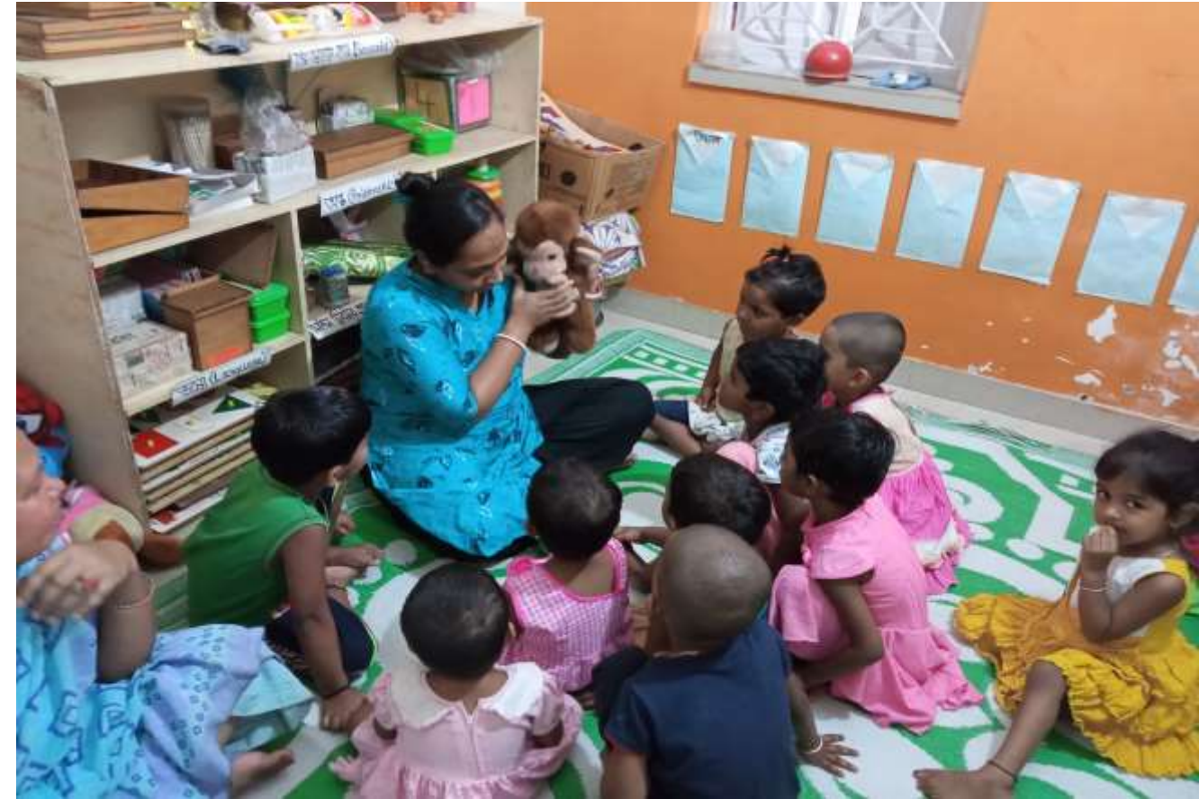
Effective Communication through story telling