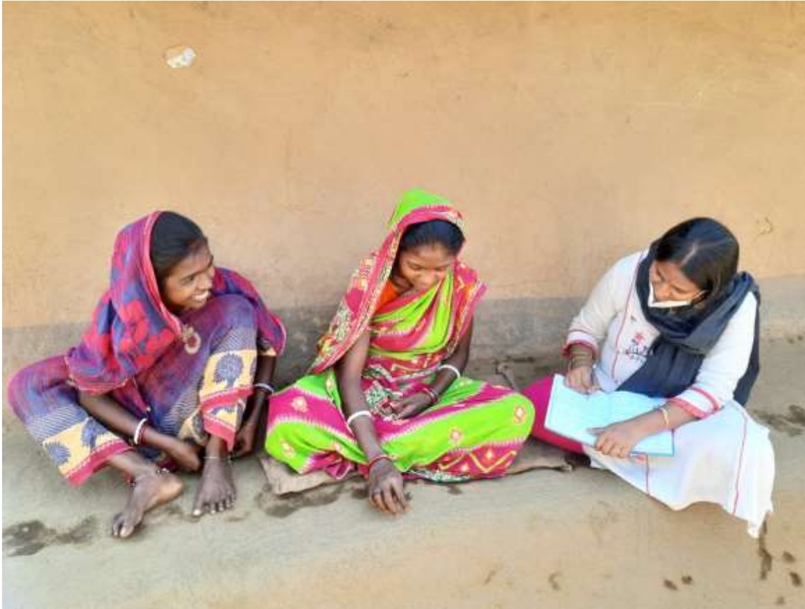
Paramita Chowdhury collecting information from mothers during home visit