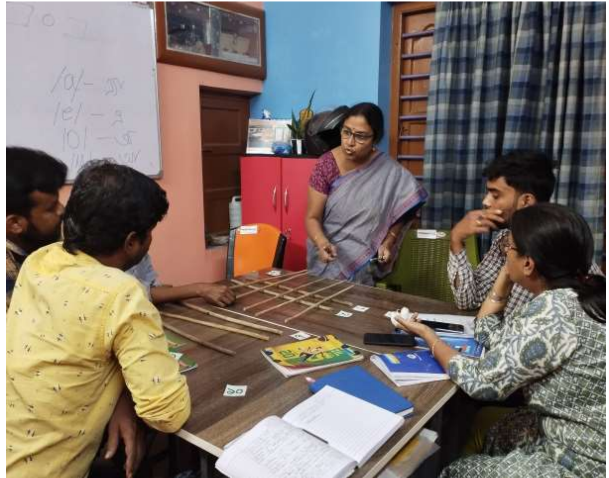
Group activity with INSPIRATION staff explaining the methodology of multiplication and division by using locally available materials as TML (teaching learning materials)