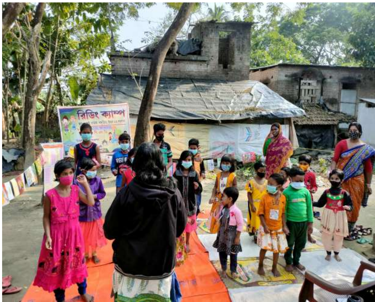
Book reading camp cum community-based library at Rasui