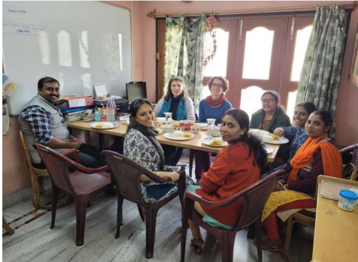
Team lunch at Kolkata work-place for Consultants