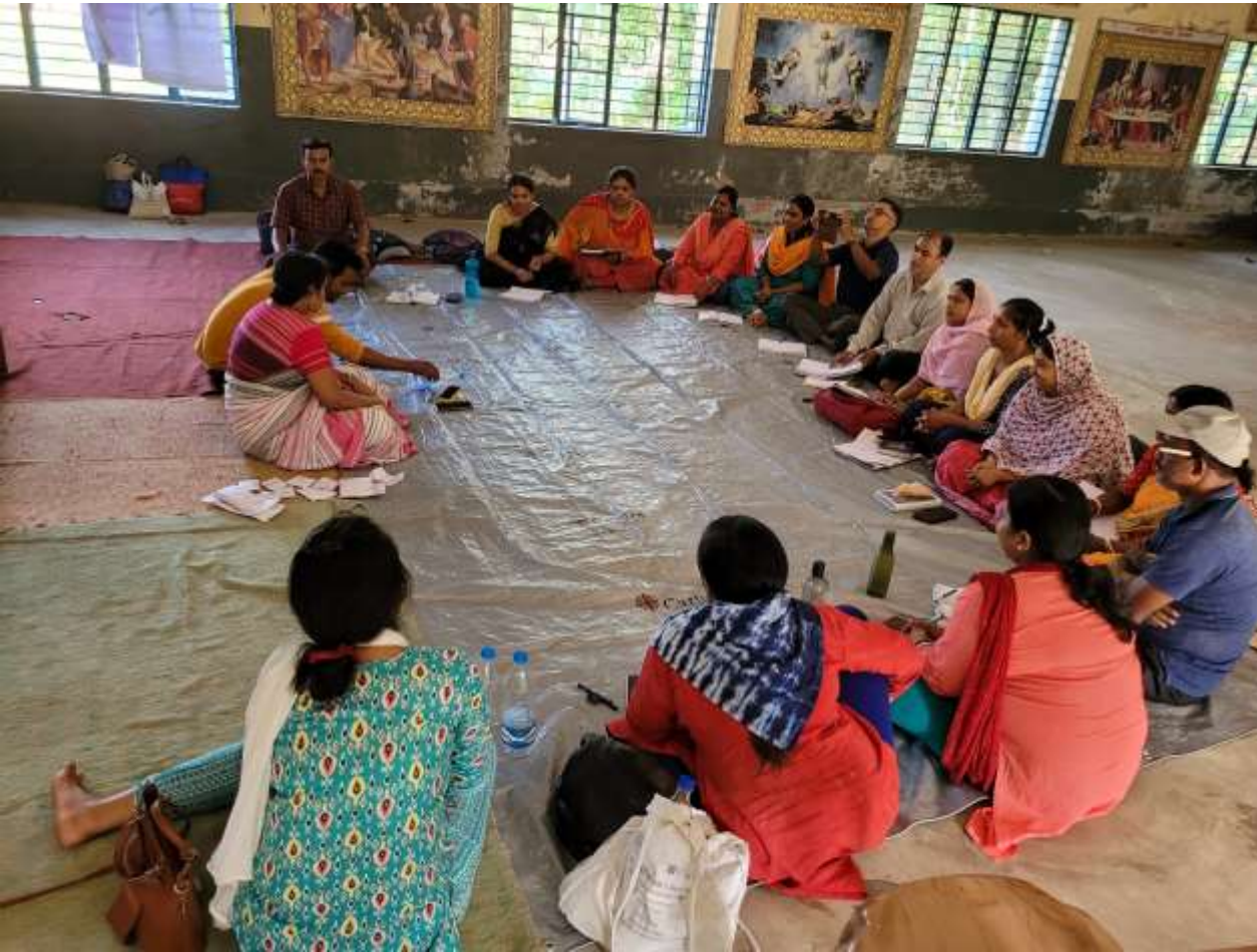
Group activities with SKC staff explaining the methodology for forming sentences