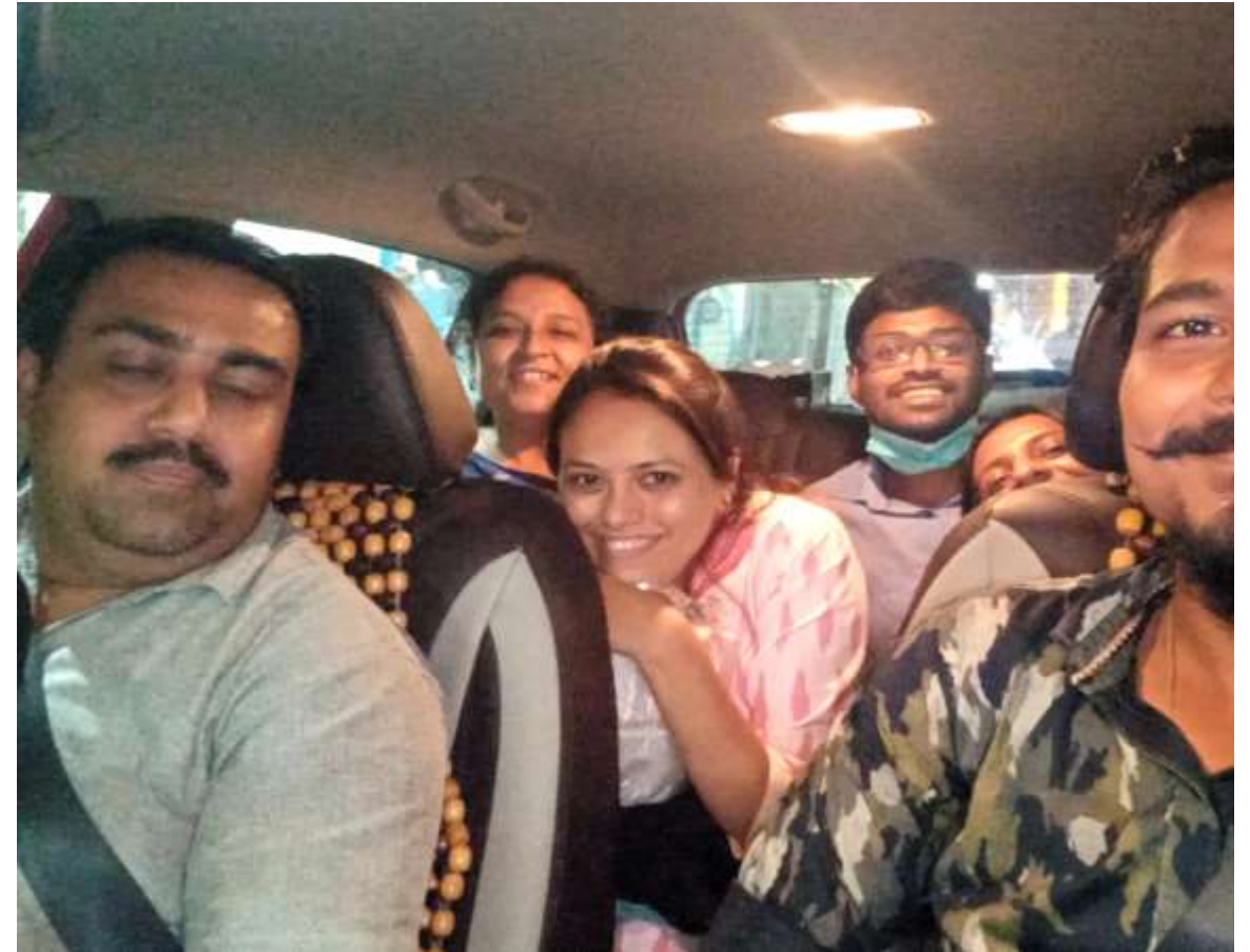
A return from Chatra: sometimes the team has to squeeze!!