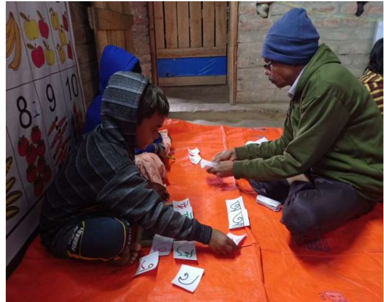
Learning Bengali Alphabets through letter cards