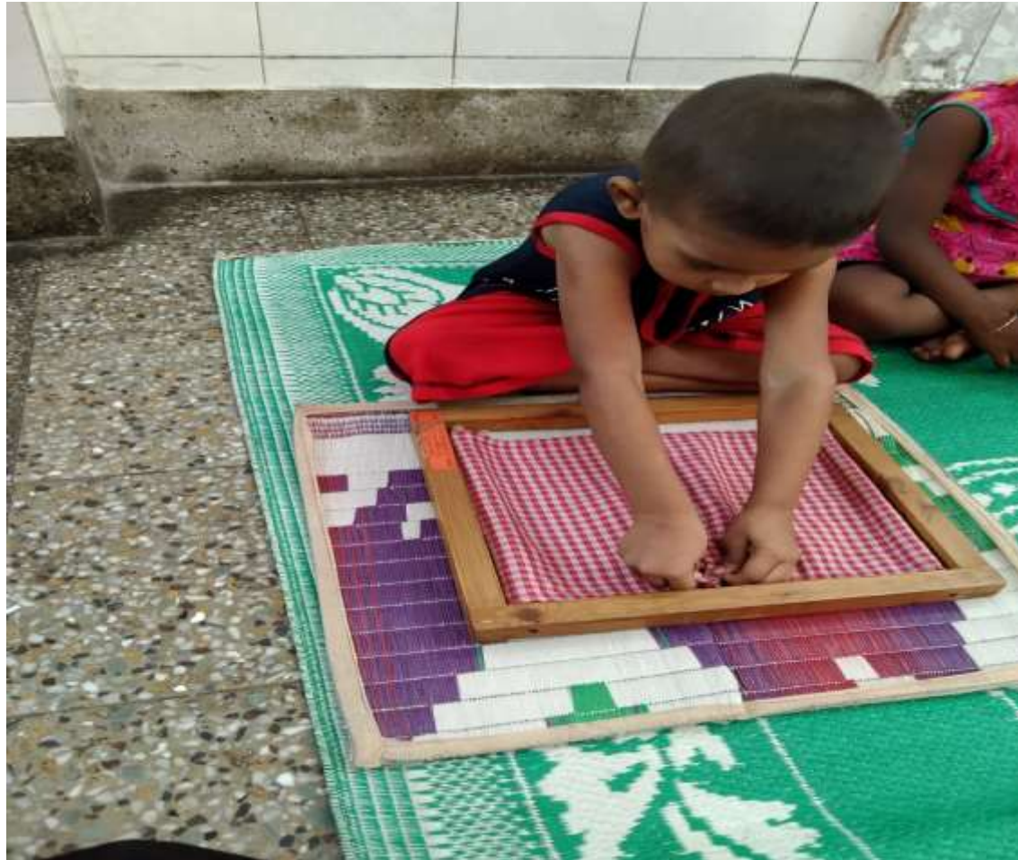
Child is capacitated on doing his work following the method of Eye-hand coordination