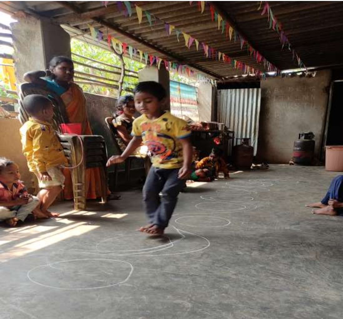
Activity based learning (counting, sensorial)