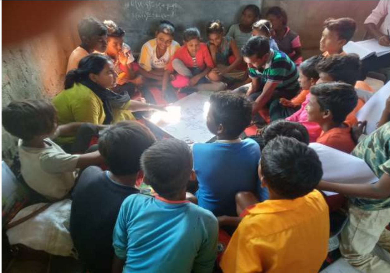
Vulnerability mapping with children of learning section of Senabona, DMSC to derive strategies for Child Protection