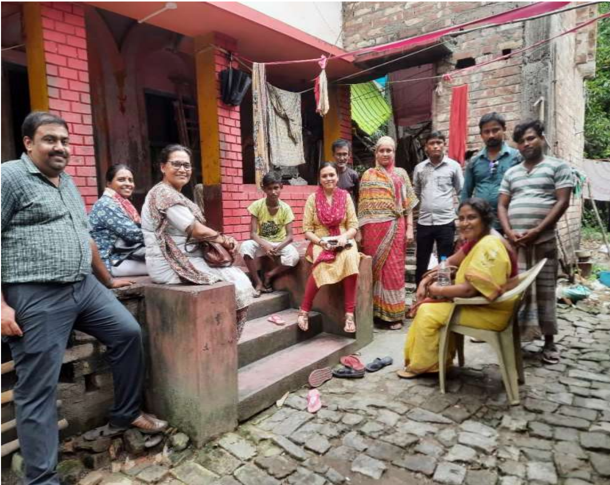
First visit after COVID by the Team of Consultants and Sanchar PC, team at community