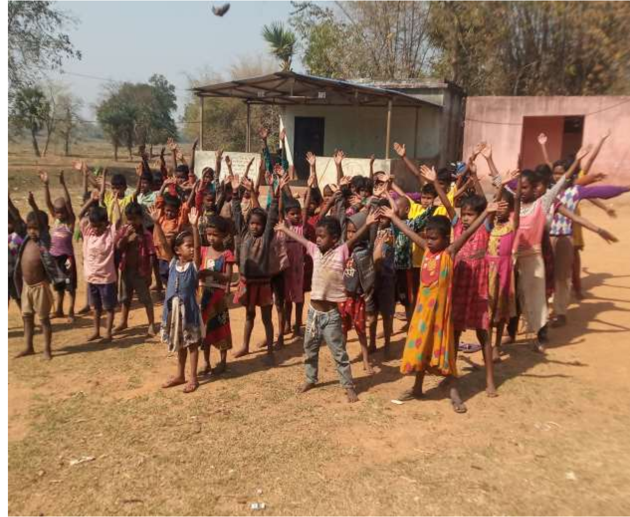
Joyful learning (performing action song)