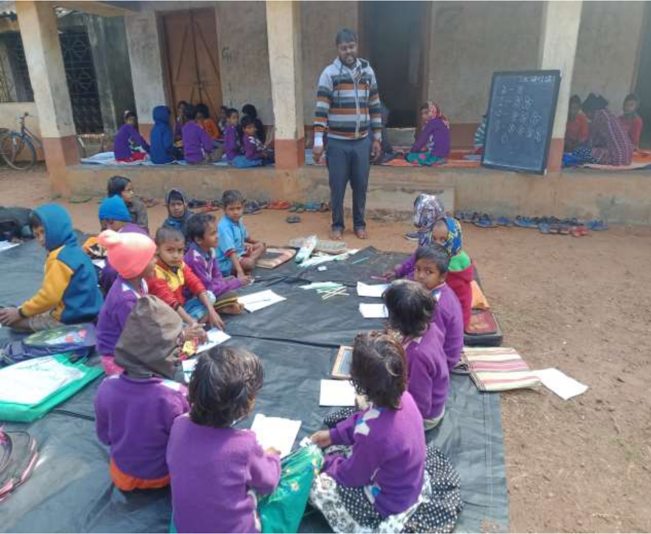
Learning level-wise seating and knowing numbers