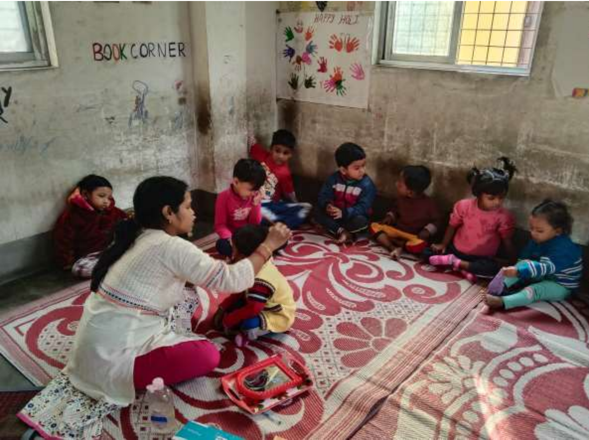
Observing the cleanliness activity being followed at Colibri creche